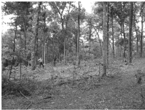
A healthy productive forest after commercial logging and biomass removal