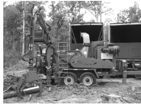
Live demonstrations of the small-scale biomass harvesting equipment shown above